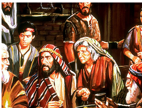
The disciples gathered on the first day of the week not for worship but for fear of the Jews.

John 20:19 Then, the same day at evening, being THE FIRST DAY of the week, when the doors were shut where the disciples were assembled, FOR FEAR OF THE JEWS, Jesus came and stood in the midst, and said to them, "Peace be with you."