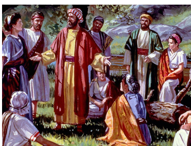
Christians met by a riverside on Sabbath when no synagogue was available.

And from there to Philippi, which is the foremost city of that part of Macedonia, a colony. And we were staying in that city for some days. And ON THE SABBATH day we went out of the city to the riverside, where prayer was customarily made; and we sat down and spoke to the women who met there .