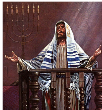
Paul preaching before leaving for Assos on Sunday.

Before Paul left Troas he gave a long sermon. He was leaving the next morning, so made the most of his time there. It was the first day of the week, and in Bible reckoning (sunset to sunset), the first day of the week commenced at sunset on Saturday night. He could have sailed that night, but chose to stay, then walk to Assos the next morning (Sunday) to catch his boat; a distance of nineteen and a half miles. He did not rest on Sunday, but regarded it as a normal day of the week. But notice that they broke bread on the first day. Many conclude that this makes the day holy, but observe the next text.