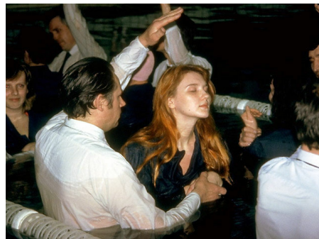
The rite of baptism is symbolic of the death, burial and resurrection of Jesus. We commemorate His resurrection by baptism not worship on Sunday.

By partaking of the symbols of bread and wine in the communion service, we are remembering Christ's death at Calvary. The bread reminds us of His broken body, and the wine of His shed blood to cover our sins. By this service we remember His death.