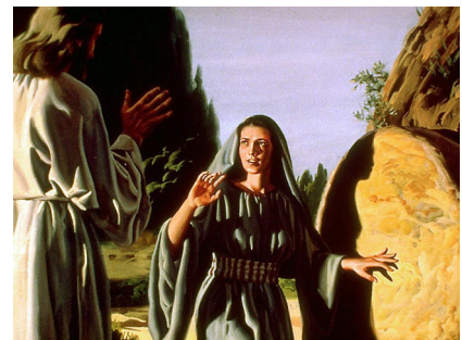
Jesus appears to Mary on the first day of the week.

The repetition continues through the gospels. Again, the book of Luke was written years after the resurrection. If any change had occurred, it would surely have been recorded, for this would have been a major issue in the mind of any Jew, even a Christian Jew: yet years after Christ ascended to heaven, the subject is met with silence. The reason is obvious – no change had occurred.